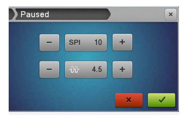
Sewhead interaction screen