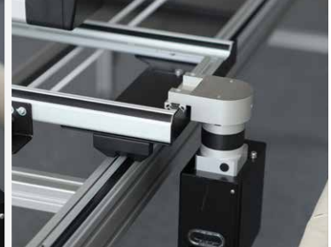
Carriage with belt drive