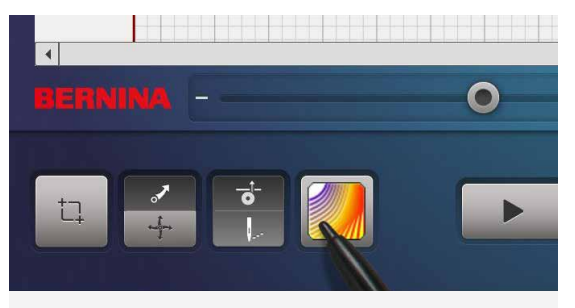
Customize designs in Art & Stitch