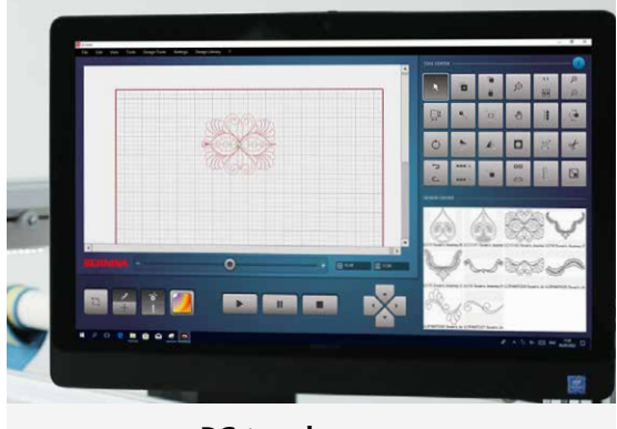
PC touch screen